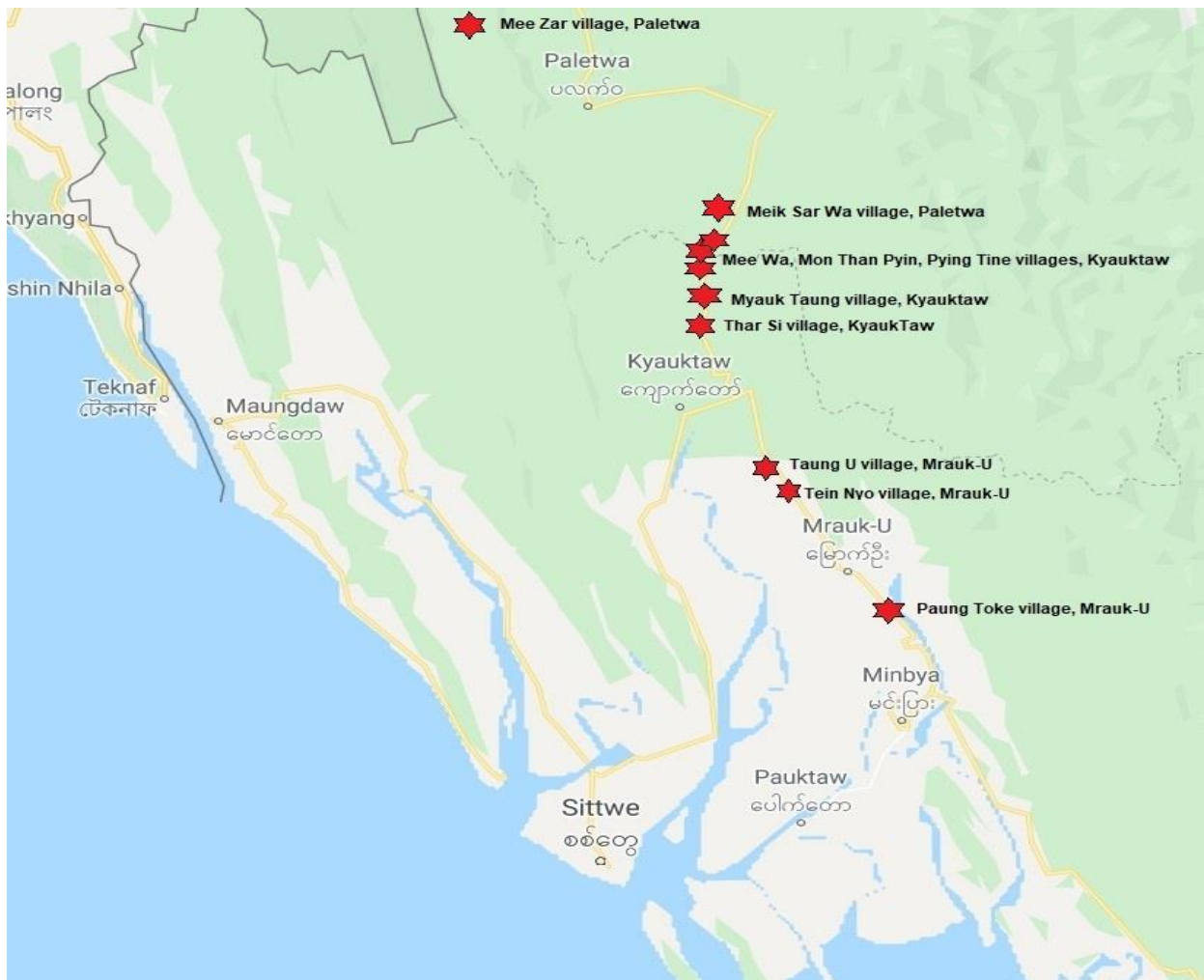
The map shows the area points where clashes occurred

On consequences of POWs matters, these clashes and seizures are considered to be the flashing point for more clashes and instability of the security situation in and around Rakhine and Chin state areas.