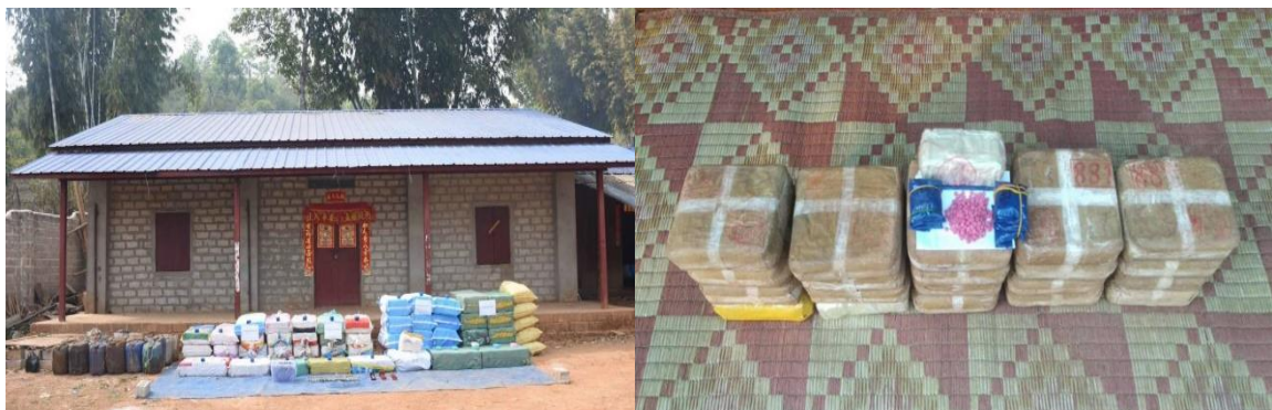
documented pictures via from Military blog