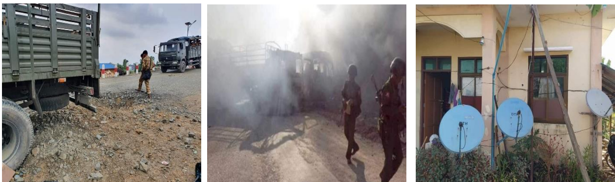
The pictures showed that the IEDs attacks conducted by AA and gunshots at Tein Nyo Hospital building