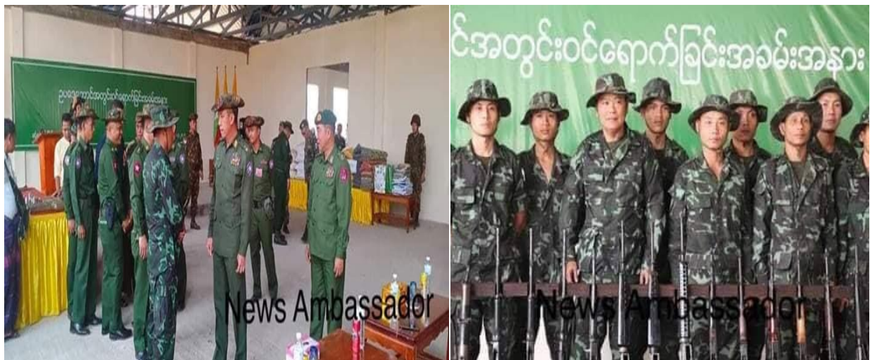
documented pictures via from printed medias

This splinter group (surrendered group) is a major active armed group in Kayin and Mon State areas. They regularly conducted attacks to KNU posts, BGP posts, Tatmadaw posts and sometimes extorted money from and disturbed civilian travelers on Hpa-An to Myawaddy express road. Now, it is believed to be an area where there is no more active armed group. The area security situation can be decreased as lower intensification.